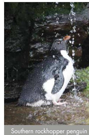
Southern rockhopper penguin