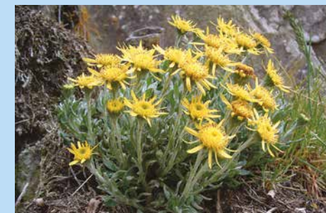
Falkland woolly ragwort